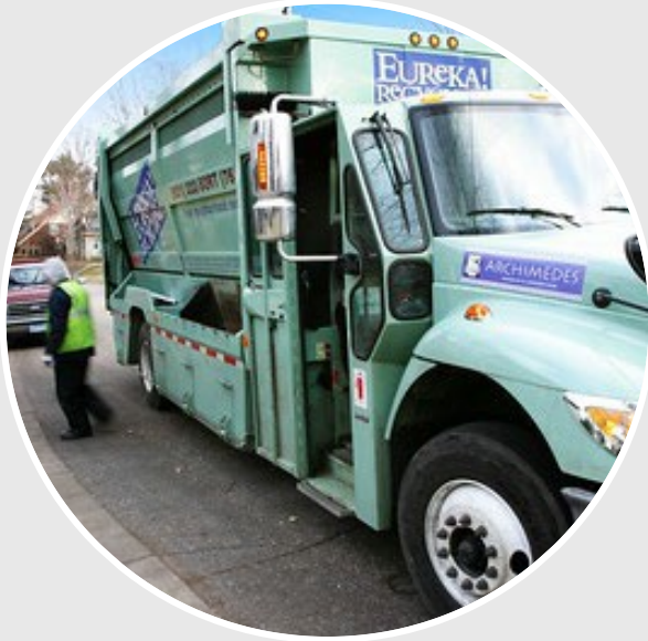
Tons of residential and commercial recyclables