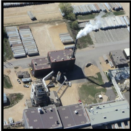
Waste to energy