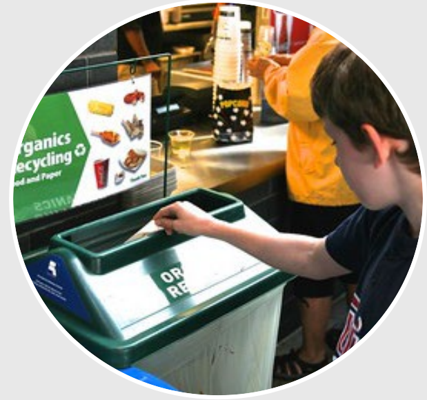
Tons of residential and commercial organics