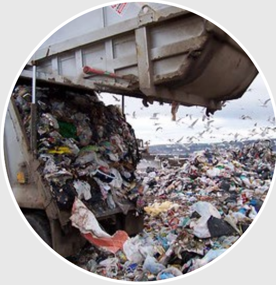
Tons of residential and commercial trash