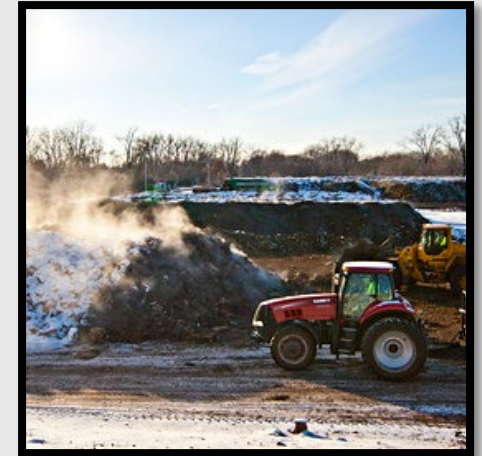
Compost or Recycling Facility